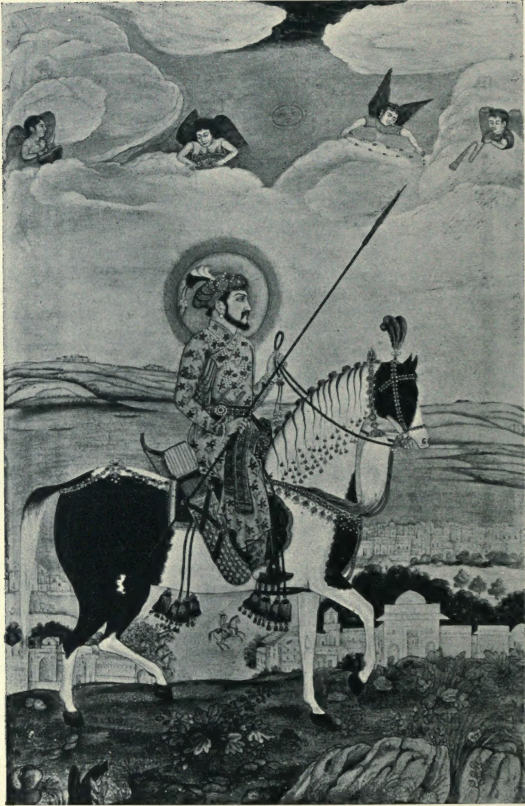
PORTRAIT OF SHAH JEHAN